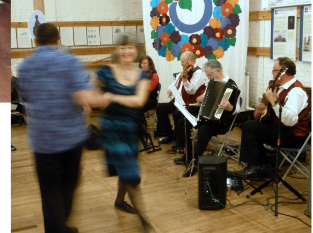
Some dancers were just moving too fast