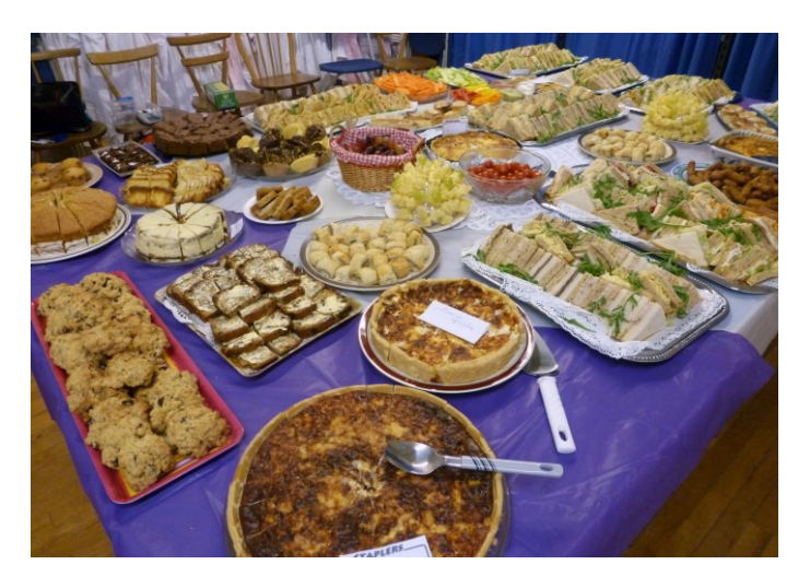
We end with food