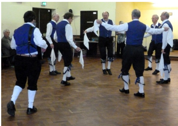
Mixed Morris side made up from Offley and Letchworth Morris Men dancing 'The Valentine' from Fieldtown